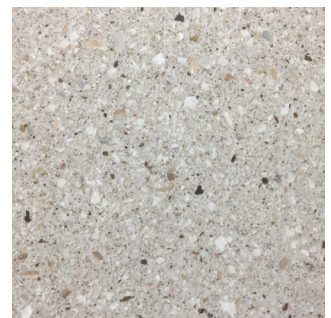
Natural Stone NS415